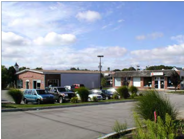
Available space and adjoining tenant seen from plaza entrance