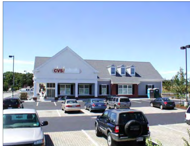
CVS Pharmacy (Just opened)