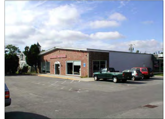
Available space seen from plaza entrance