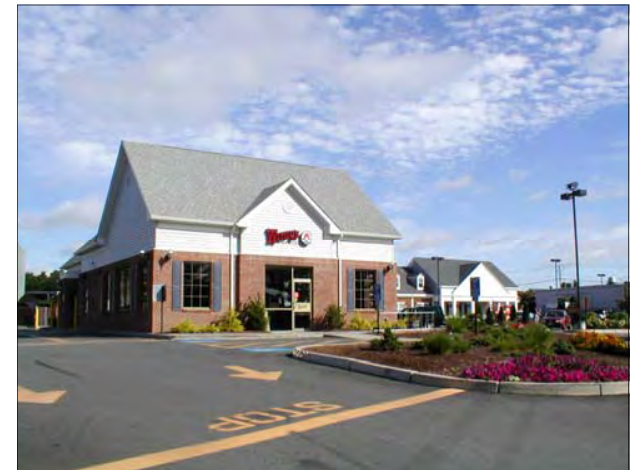
Wendy's seen from Old Townhouse Road. This is the second plaza entrance (with CVS in the background).