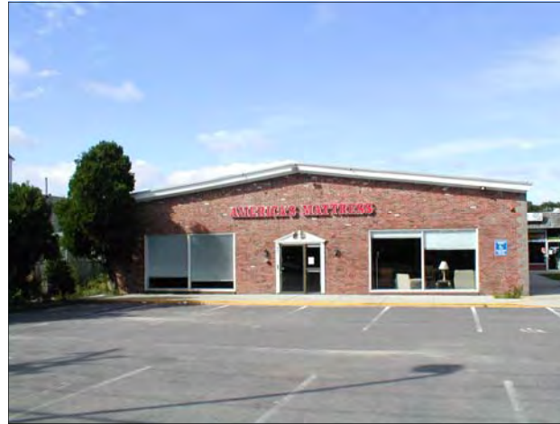
Available space seen from Station Avenue