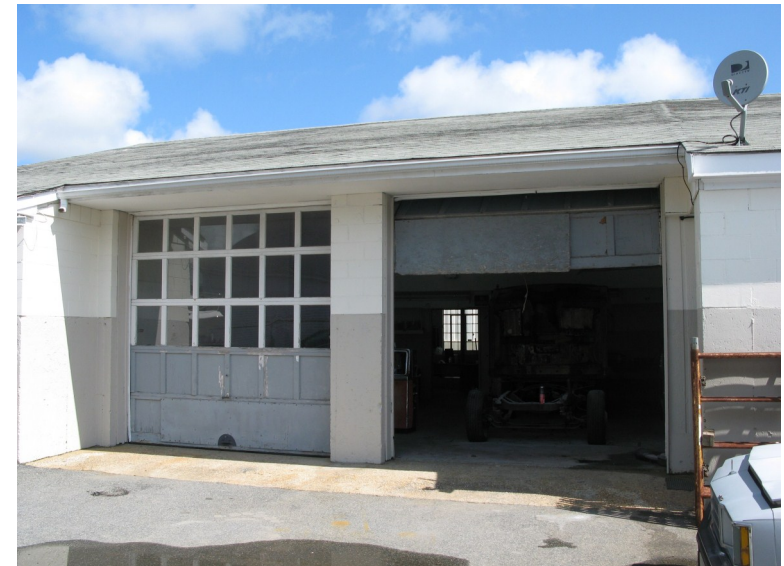
2 Repair Bays

This information has been secured from sources we believe to be reliable, but we make no representation or warranties, expressed or implied, as to the accuracy of the information. Referenced square footage and acreage and sketched outlines of the property are approximate. Buyer must verify all the information and bears all the risk for any inaccuracies.