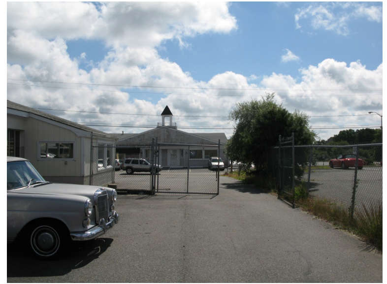
Fenced and Gated