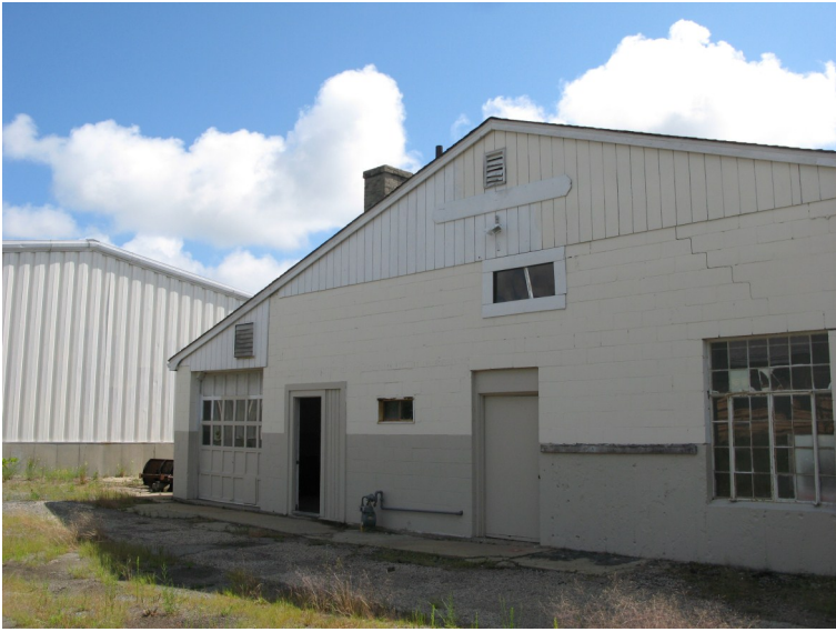
3rd Repair Bay on back of building